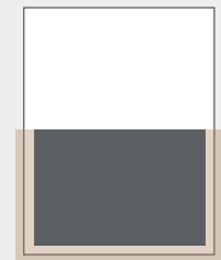
1/2 Horizontal Bleed 9" x 5.25" add .125" bleed