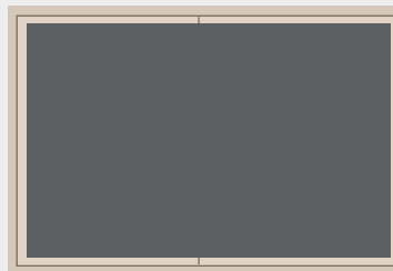
Two Page Spread Bleed 18" x 10.875" add .125" bleed