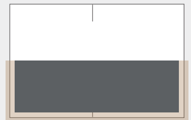
1/2 Spread Bleed 18" x 5.25" add .125" bleed